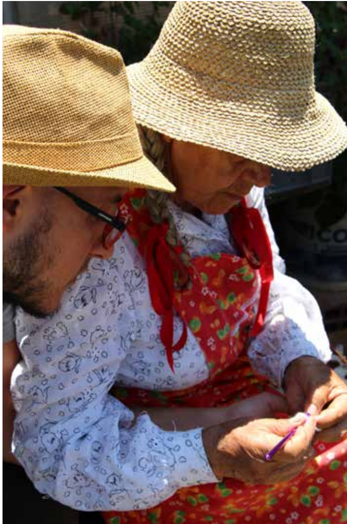
ACCOMPANIMENT METHODOLOGY (TABLE B)

In Antioquia, rural societies are generating autonomous actions for resolving conflicts, renaming spaces and making collective reparations. Casa Bahareque will be a space that calls the meetings for these initiatives to accompany them in their development, to empower them to trust on their techniques and aesthetic languages, in addition to the possibility of replicating the experiences in different places of eastern Antioquia. ( See table B )